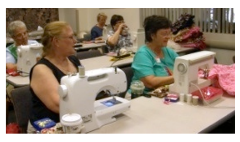
Our season kick-off Bee was held at the Chandler Police Dept. Community Room. It was hosted by the AZB4K Board. The beautiful fall weather allowed several of our volunteers to work outside on the patio. We had a full house with 46 people working hard. We turned in a record 249 quilts