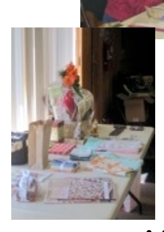
Trash Tote and Finger Pincushion