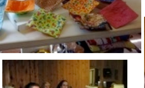
Finger Pincushion demo